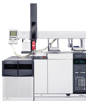
Triple Quadrupole GC/MS