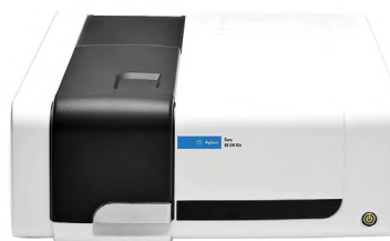
UV-Vis & UV-Vis-NIR