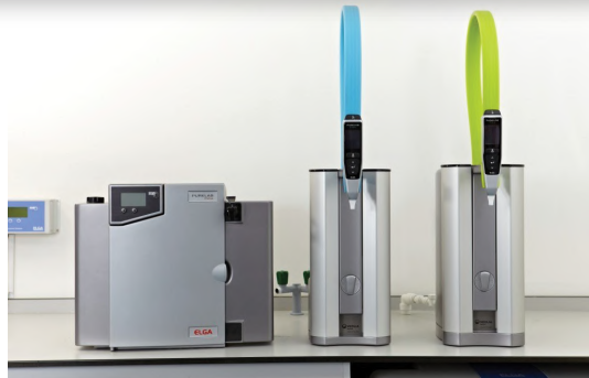
Ultrapure Water Purification System Type 1/ Type 1+