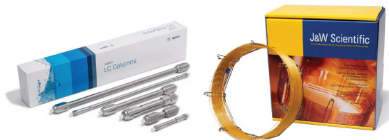
LC & GC Columns