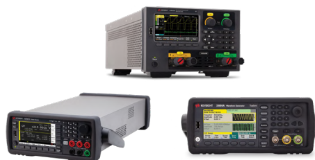
Generators, Sources and Power Supplies