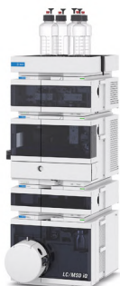
Single Quadrupole LC/MS