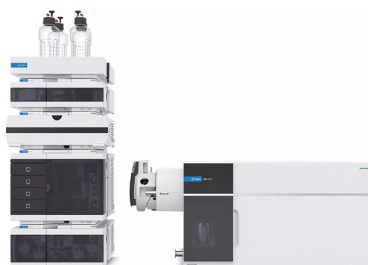
Triple Quadrupole LC/MS